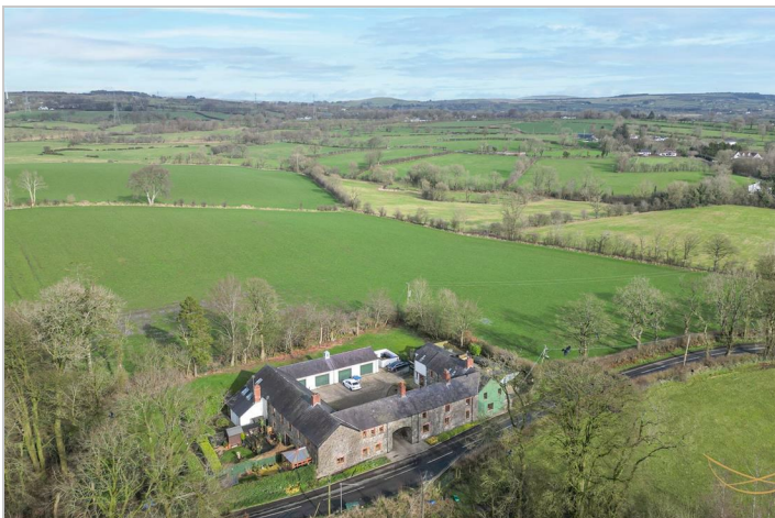
2 Dixons Corner, Ballyclare